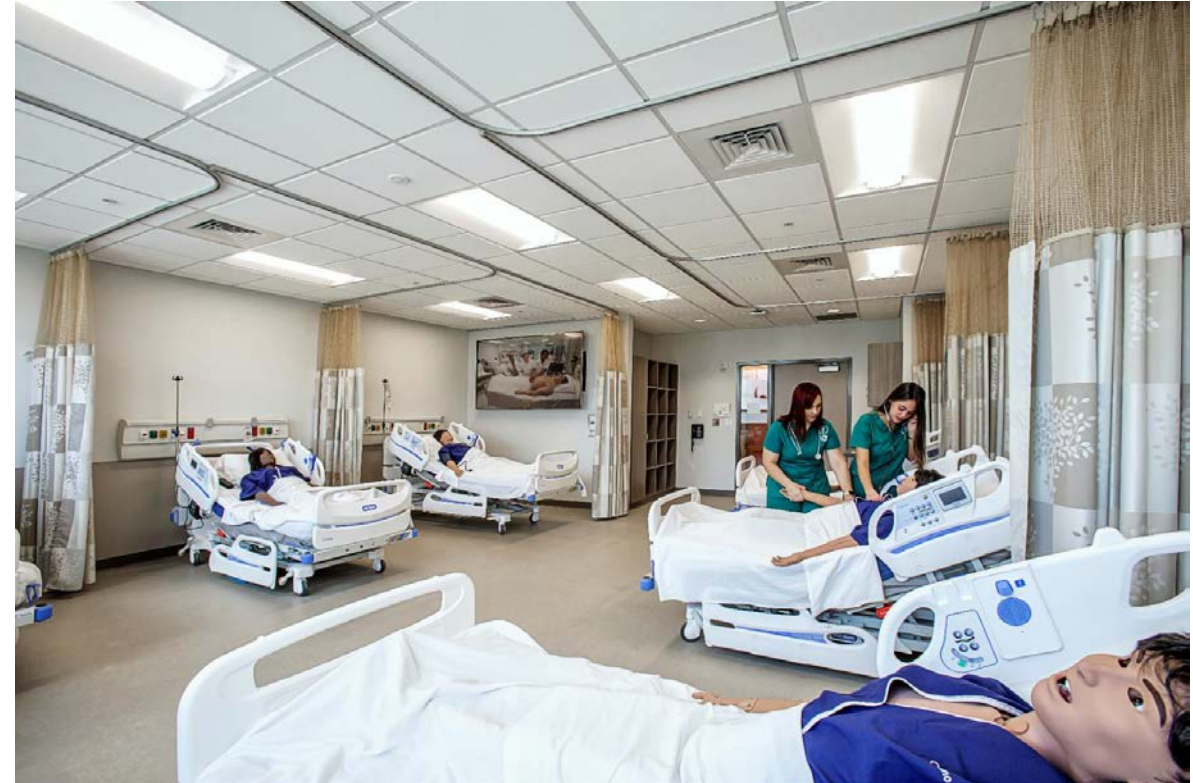
Medical Skills Lab Stations