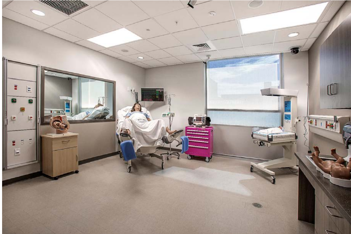
Simulation Operating Room