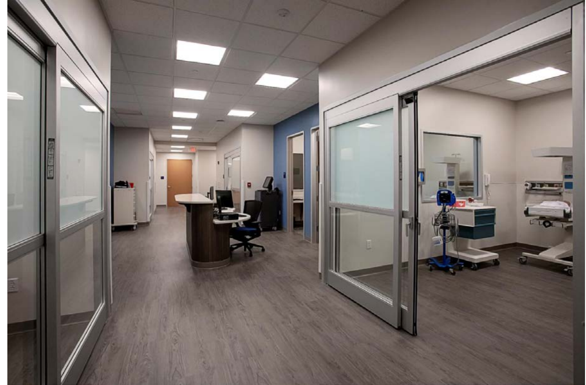
Hospital Simulation Environment