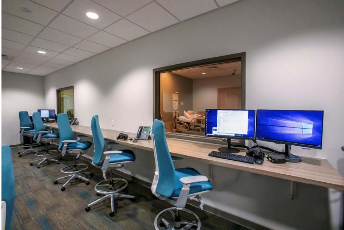
Simulation Control & Observation Room