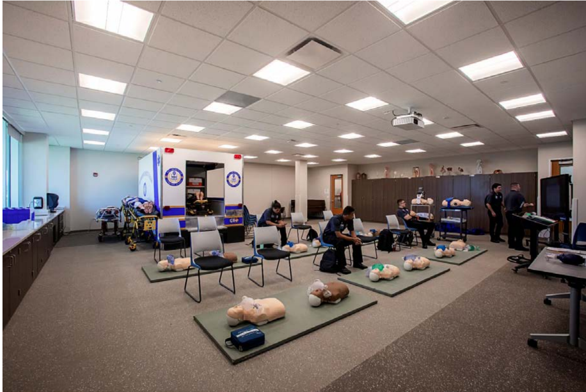
CPR Simulation Classroom