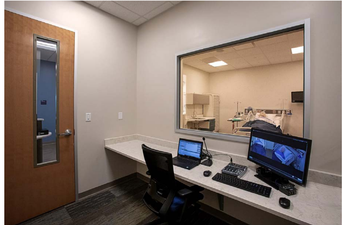
Simulation Control Room