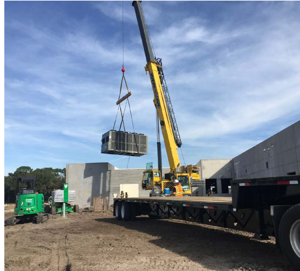
Chillers Lifted into Place