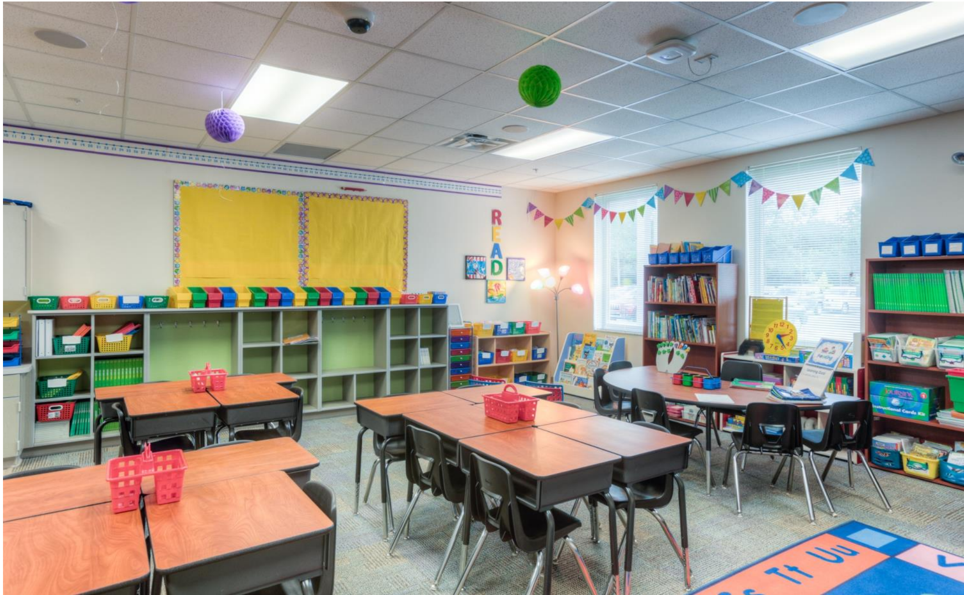
Example - Classroom