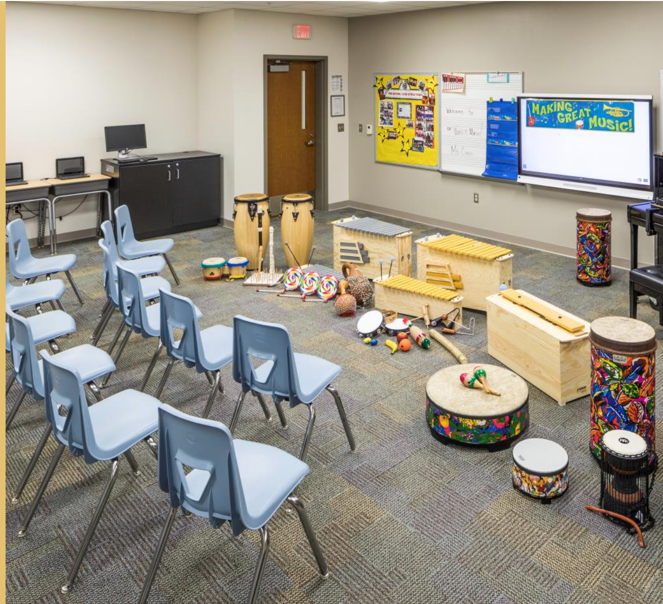
Example – Music Room