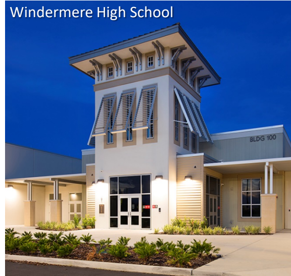
Windermere High School