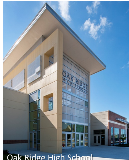
Oak Ridge High School