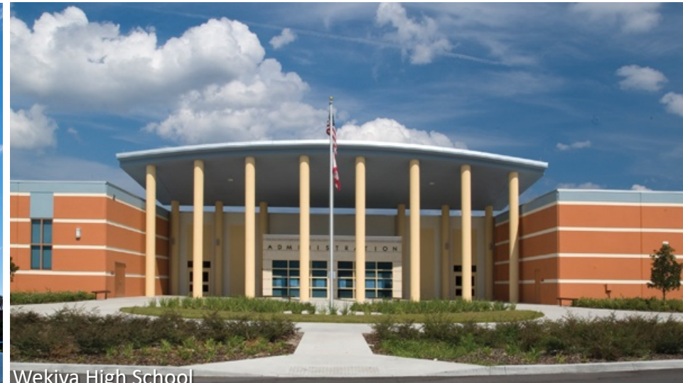
Wekiva High School