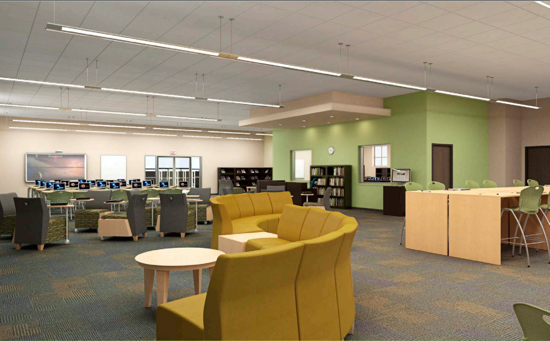
Example – Media Center