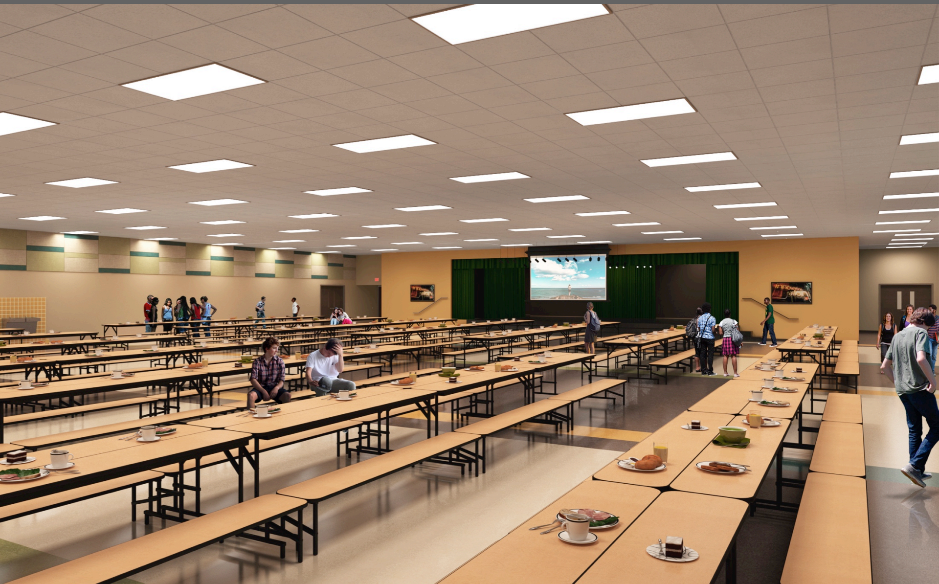
Example - Multi Purpose Room