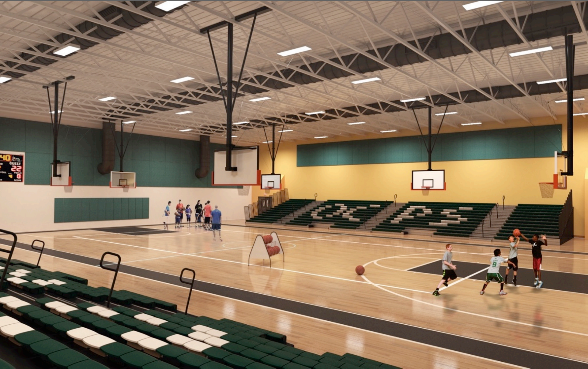
Example – Gymnasium