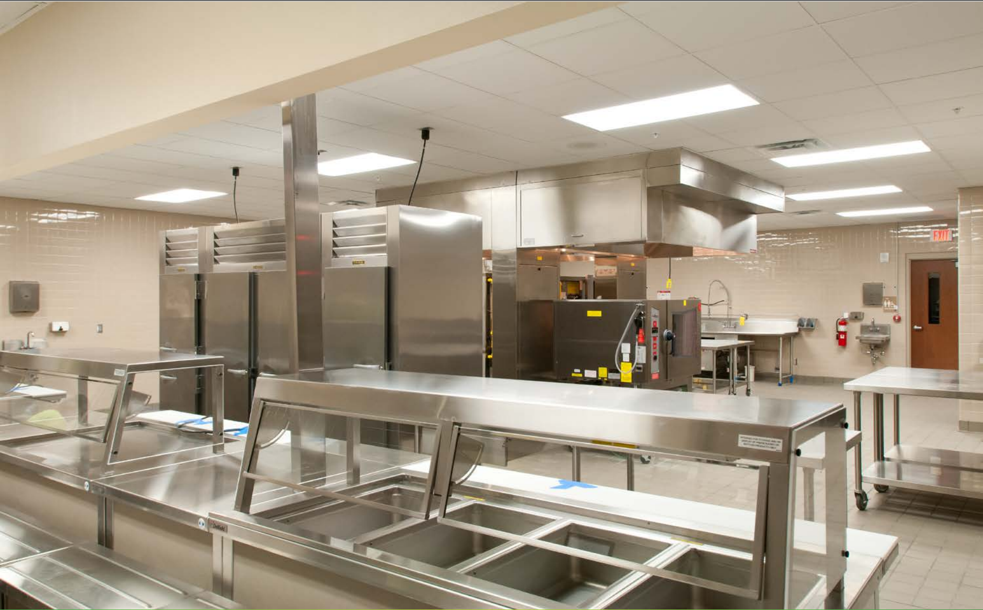
Example – Kitchen