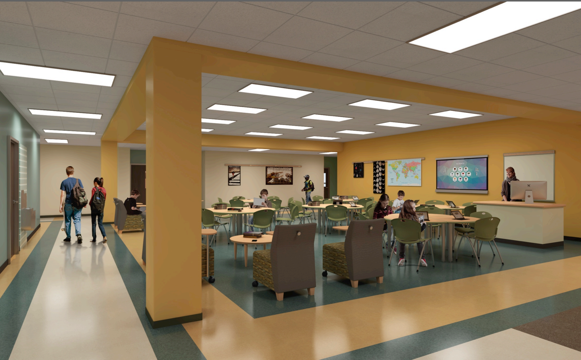
Example - Technology Resource Center