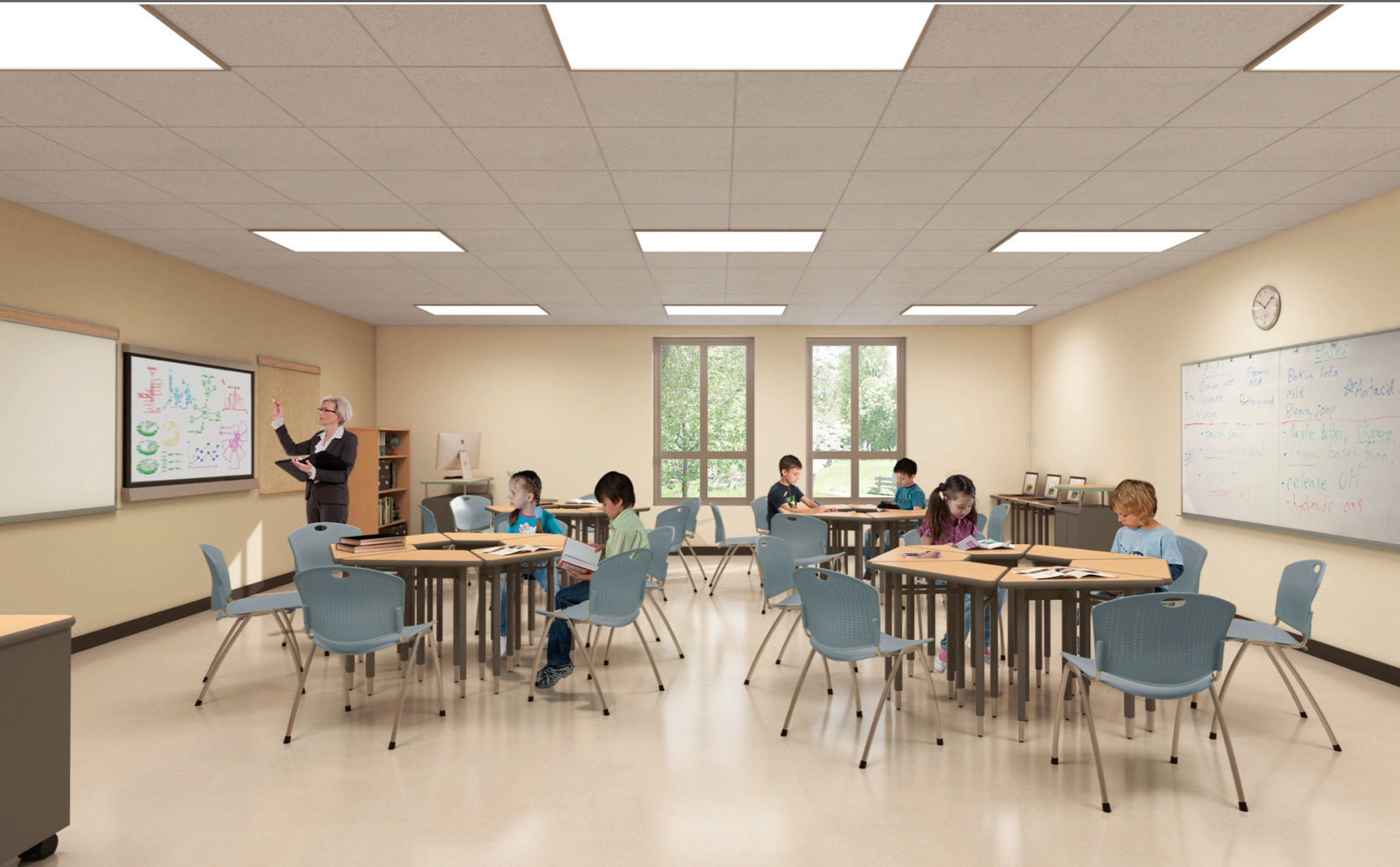
Example - Typical Classroom