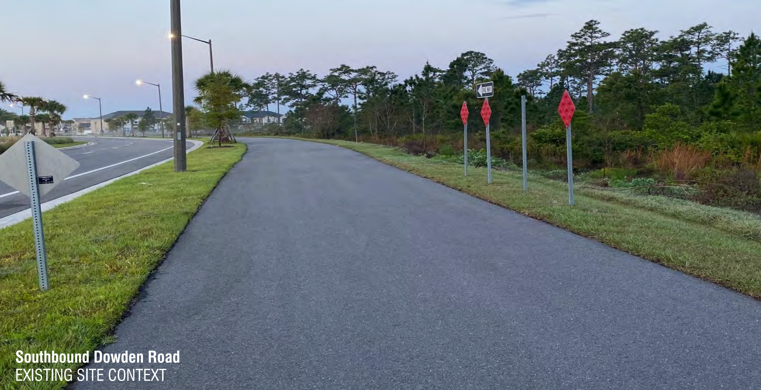
Southbound Dowden Road EXISTING SITE CONTEXT