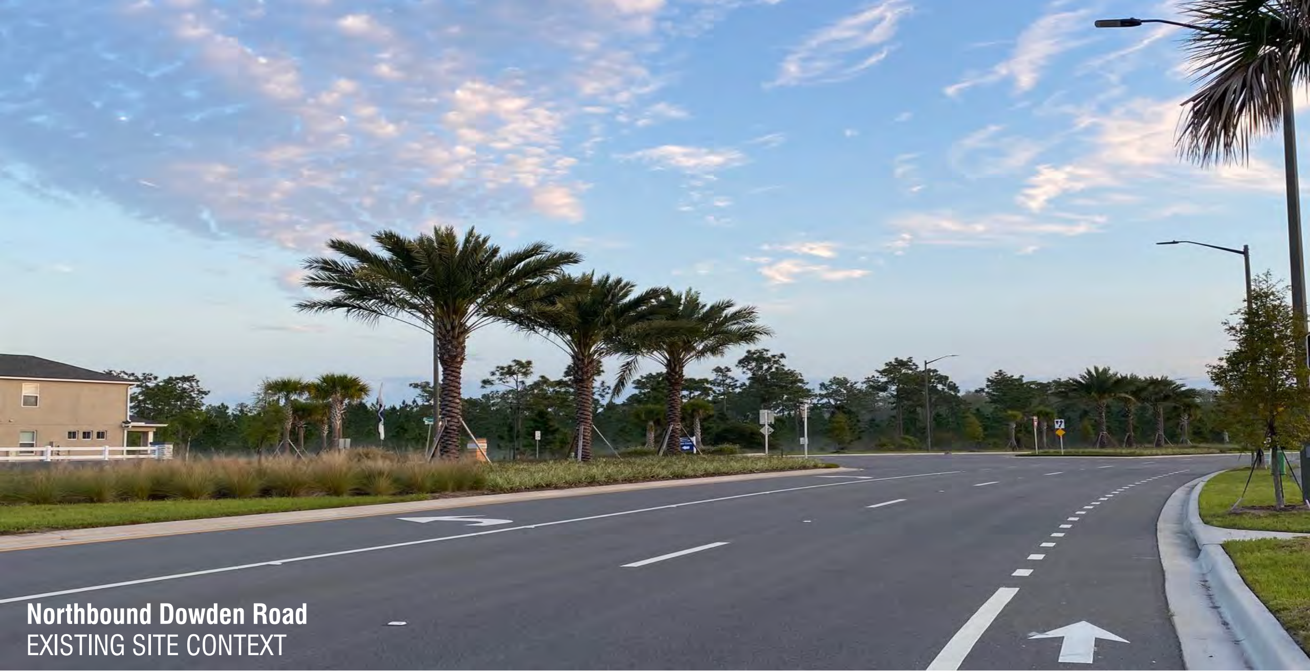
Northbound Dowden Road EXISTING SITE CONTEXT