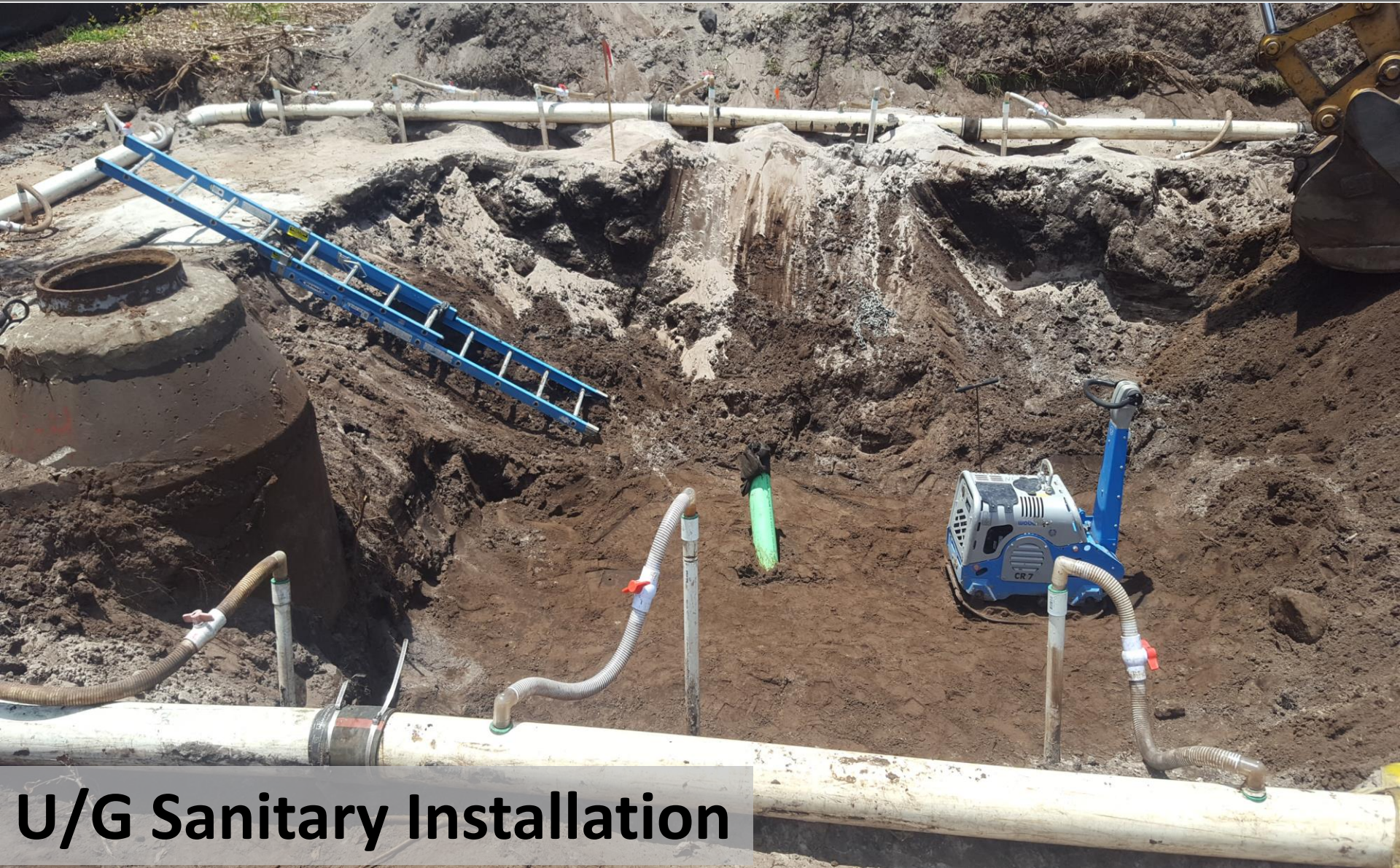
U/G Sanitary Installation