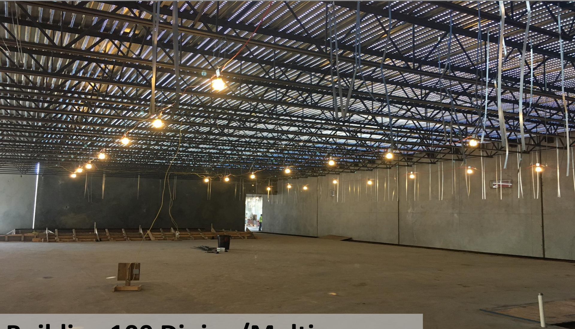
Building 100 Dining/Multipurpose