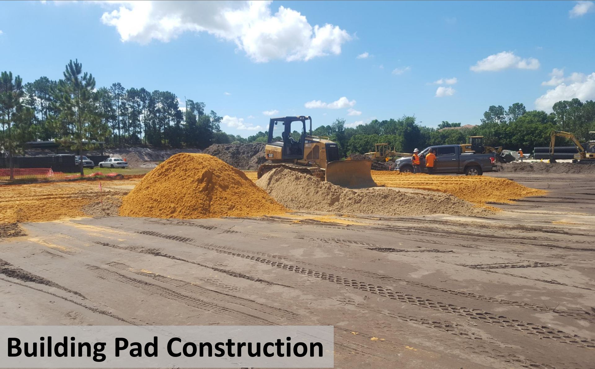
Building Pad Construction