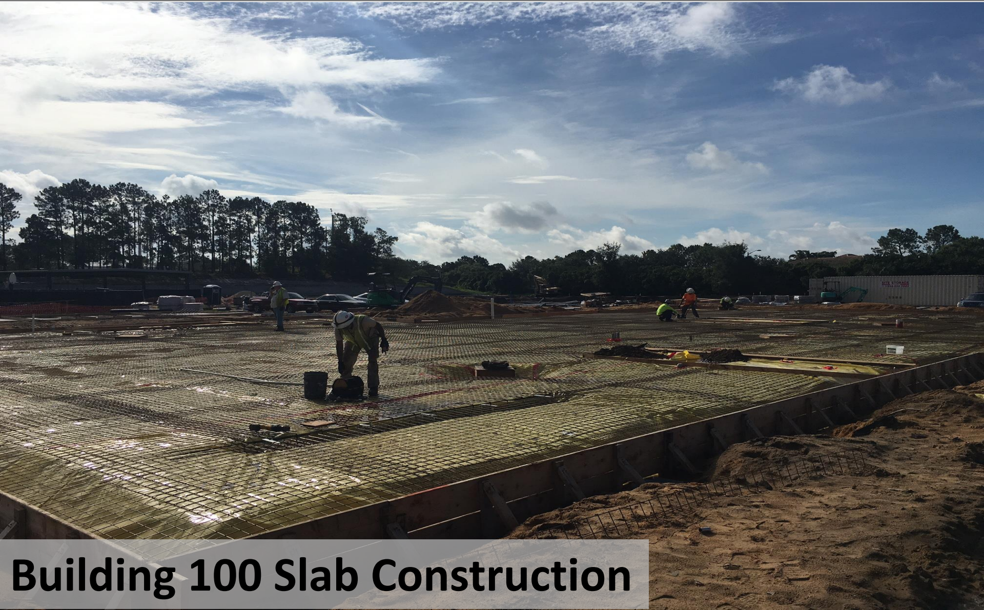
Building 100 Slab Construction