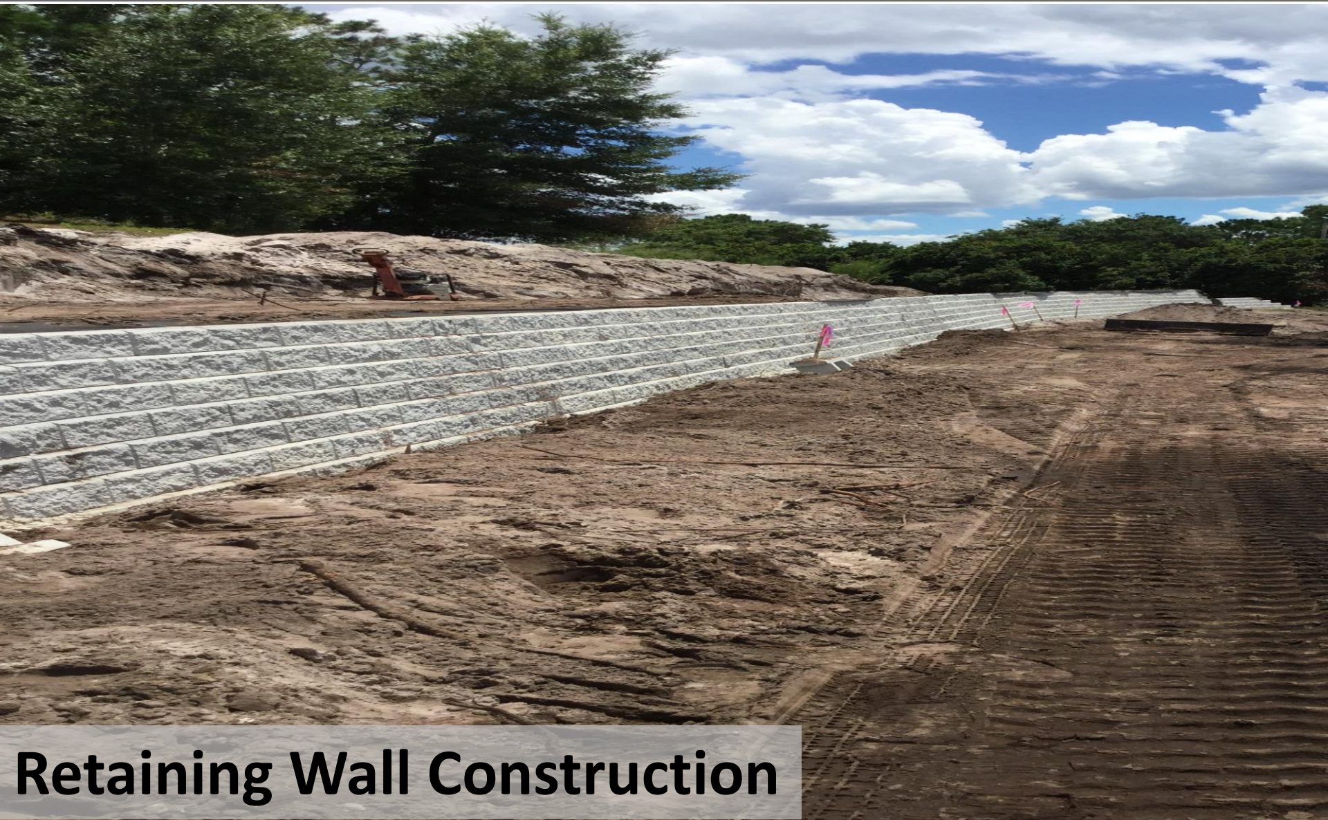
Retaining Wall Construction