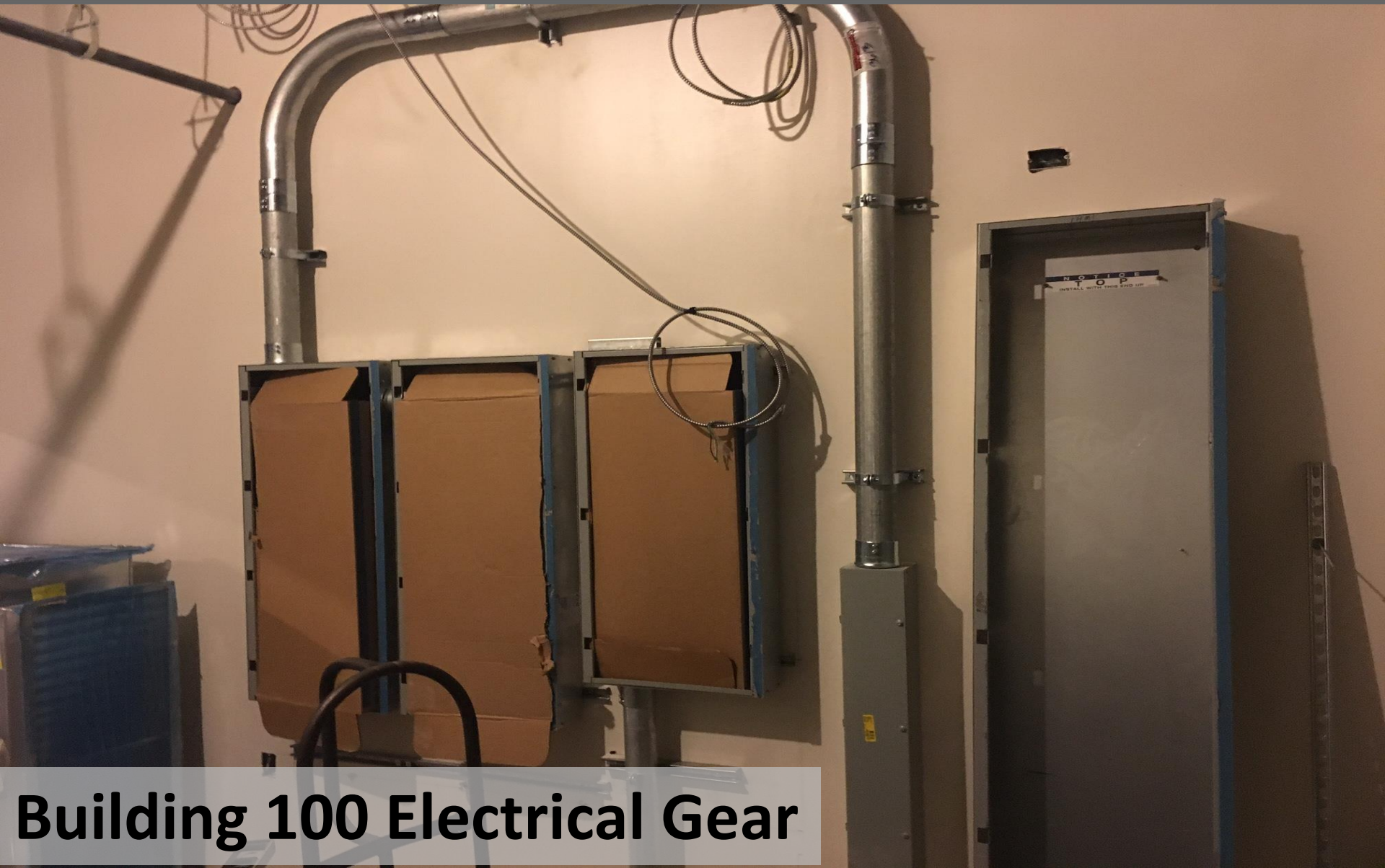
Building 100 Electrical Gear