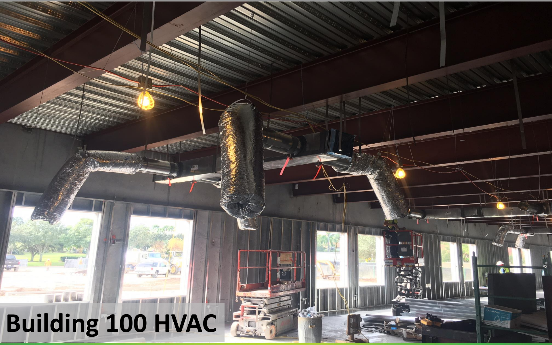
Building 100 HVAC