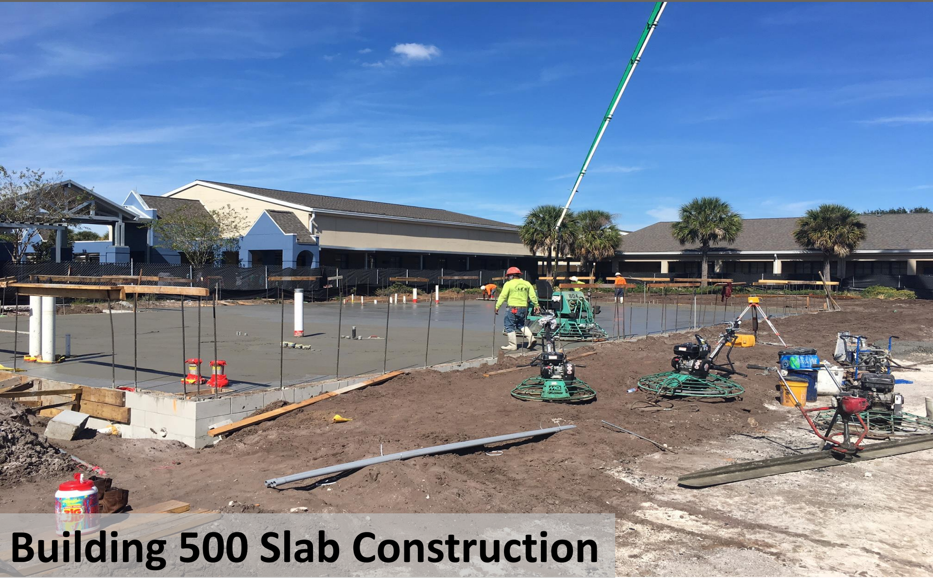
Building 500 Slab Construction