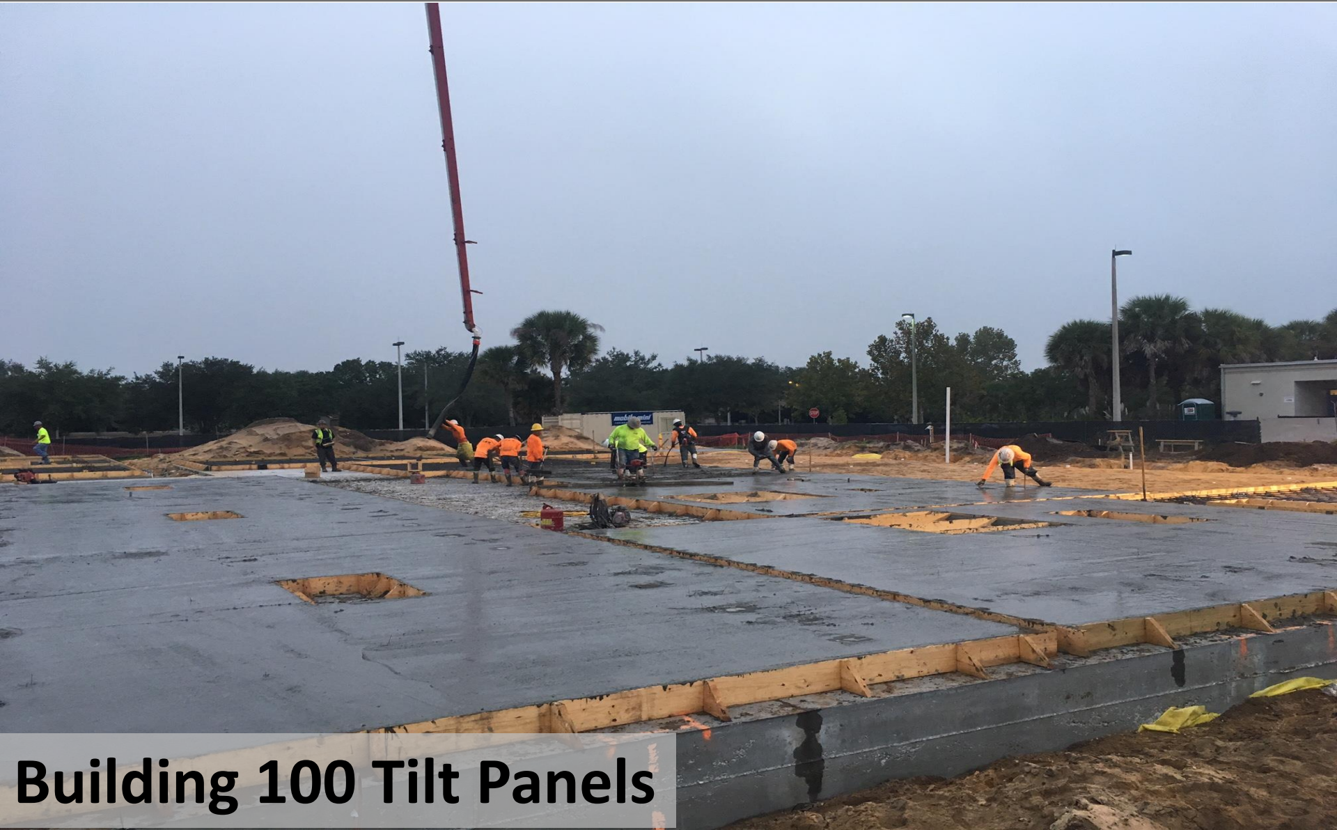
Building 100 Tilt Panels