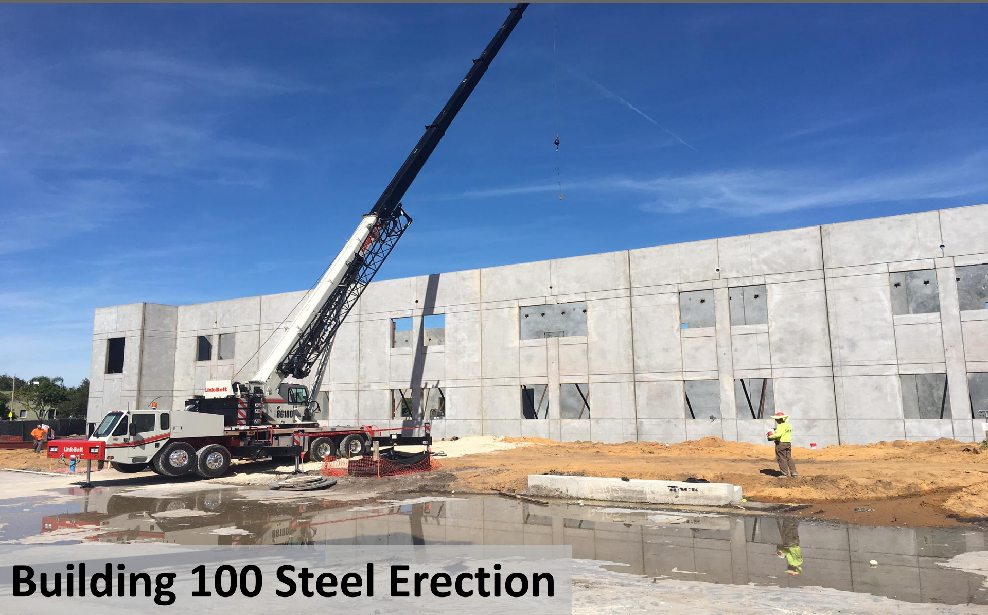
Building 100 Steel Erection