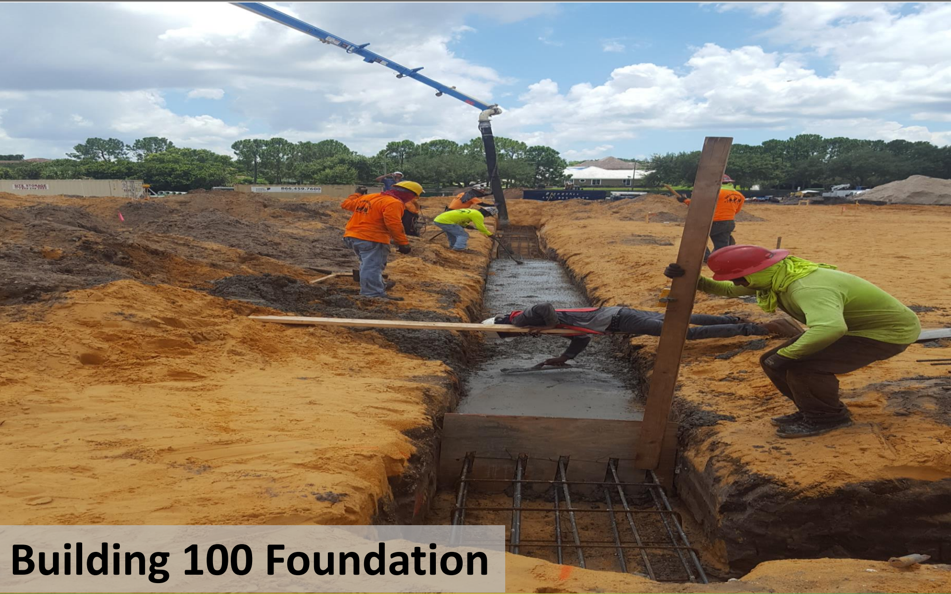
Building 100 Foundation