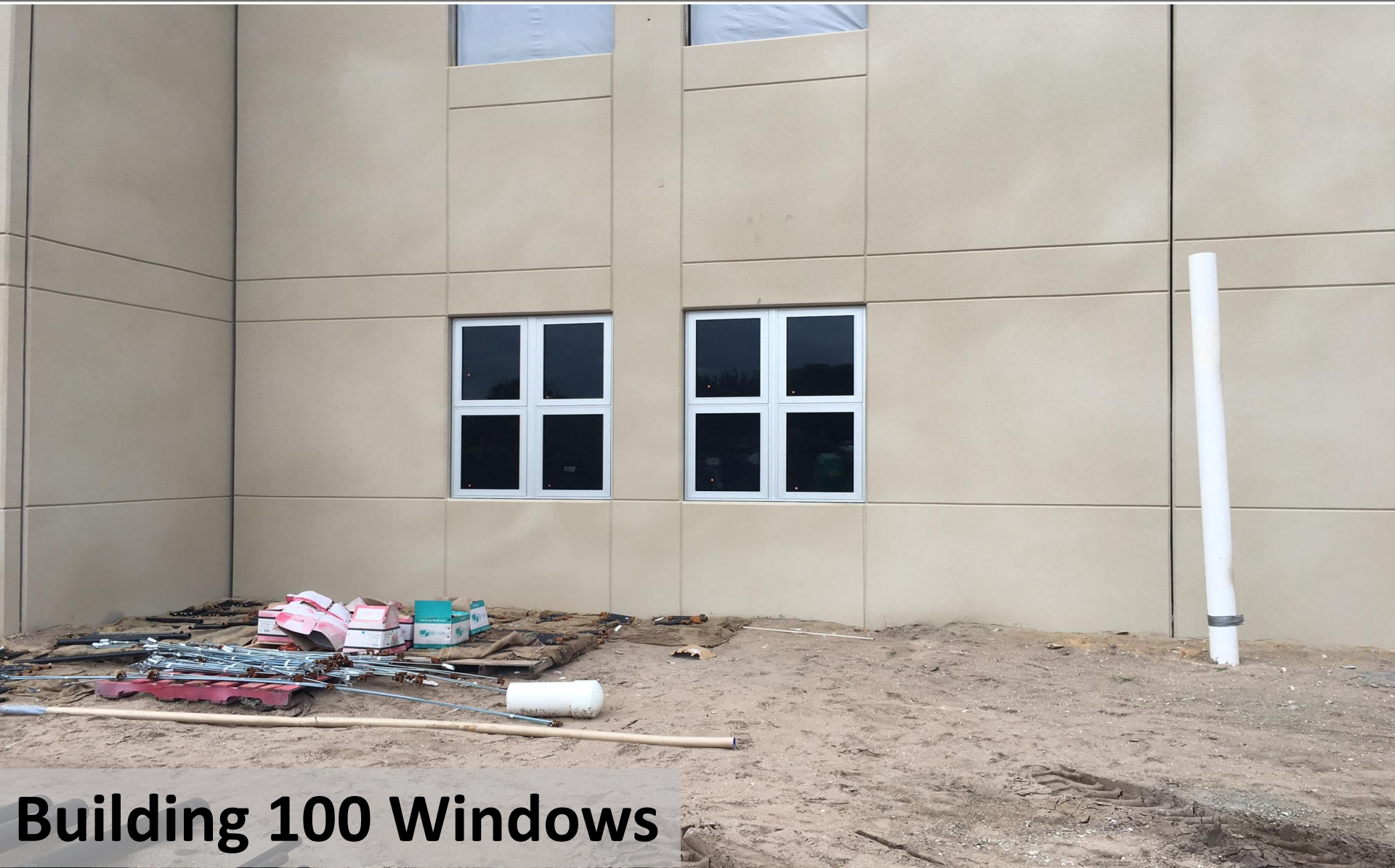
Building 100 Windows