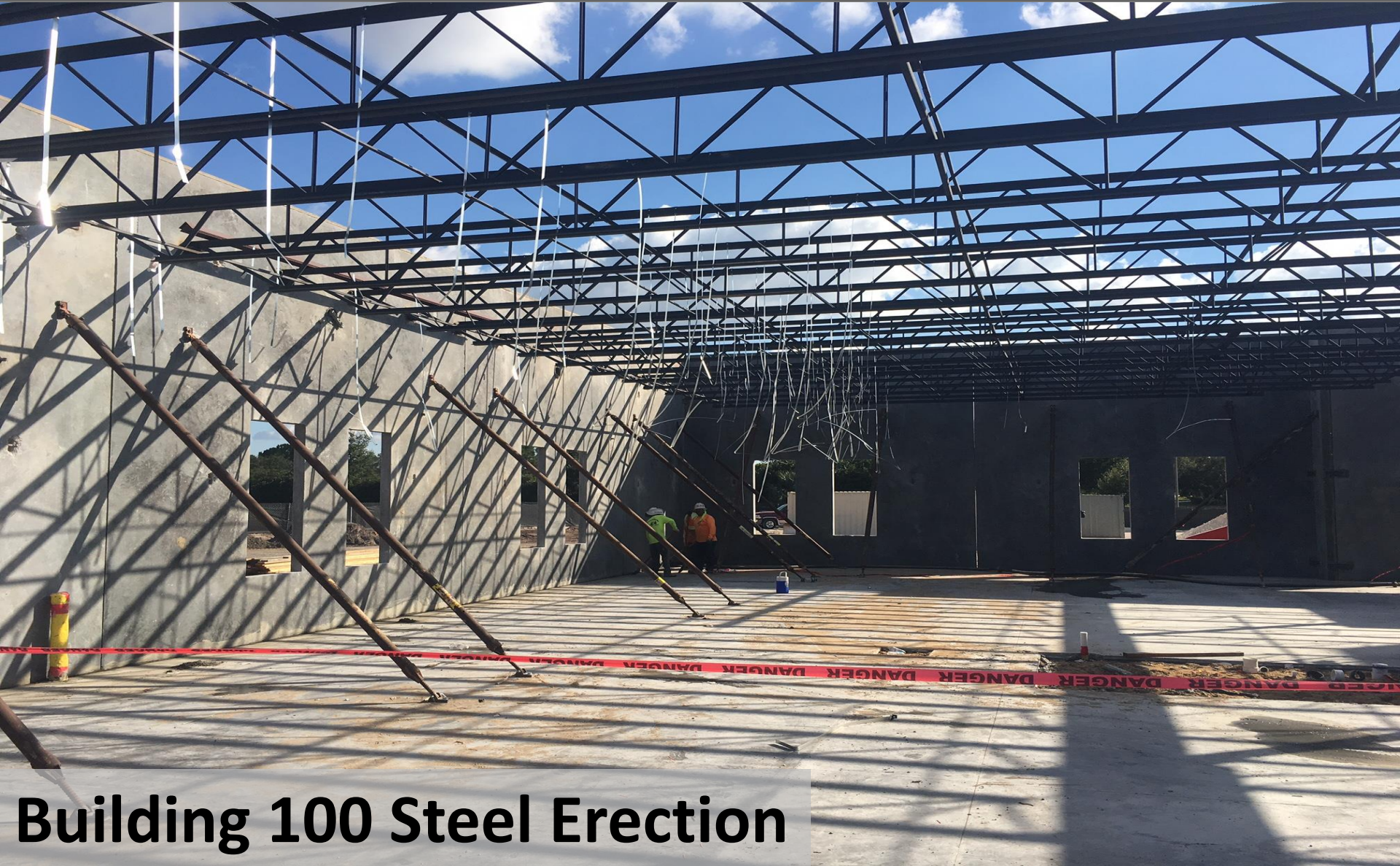
Building 100 Steel Erection