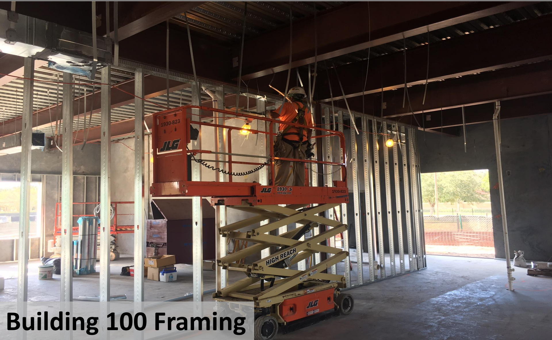
Building 100 Framing