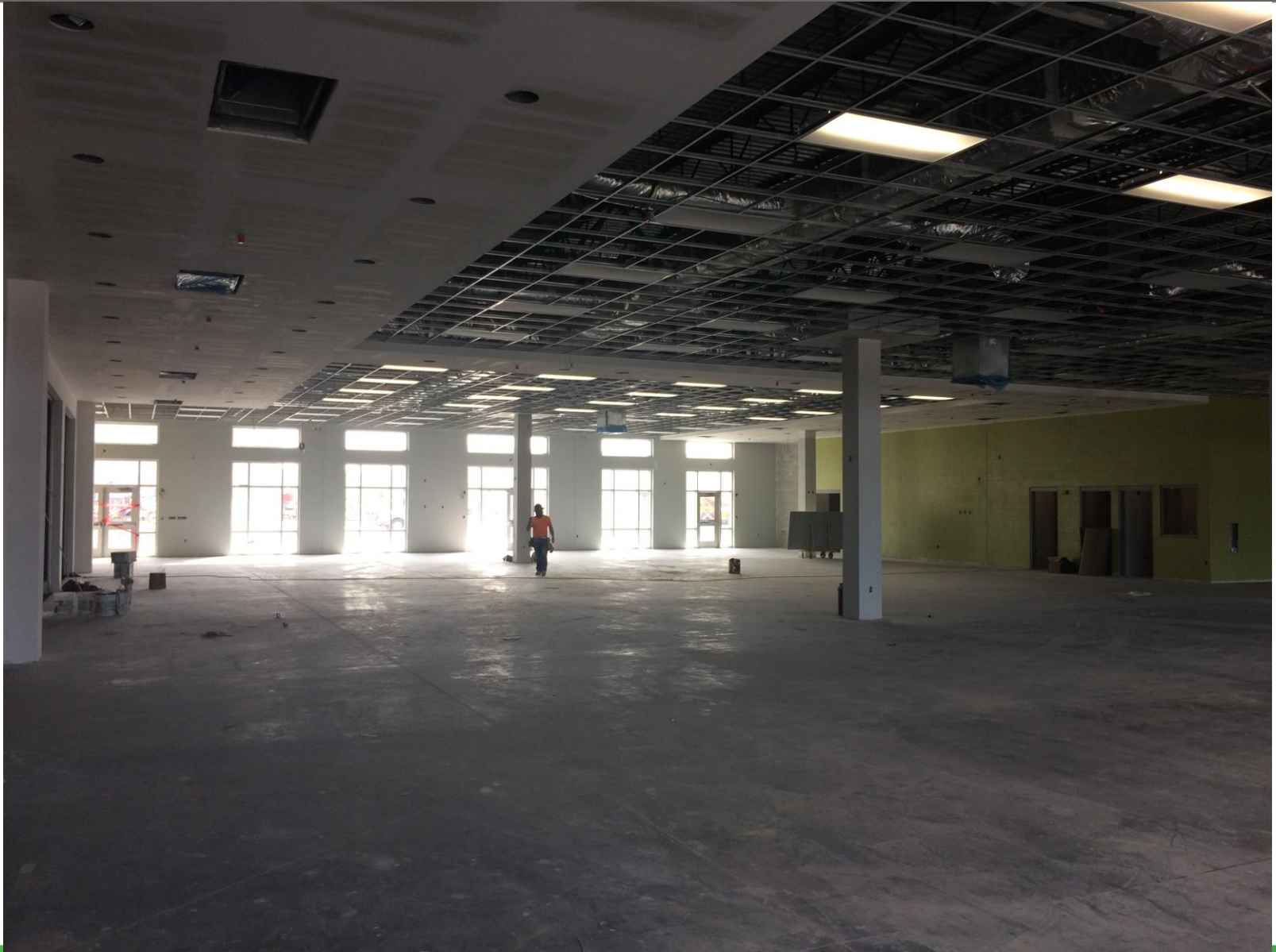
Bldg 700 - Cafeteria